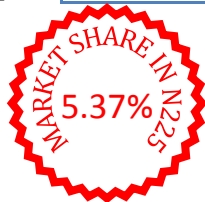
Historical Average Daily Traded Value and Market Share in N225